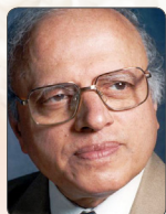
M S Swaminathan World First Food Laureate (1987)